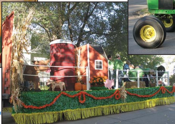
Hand-made miniature barn and silo