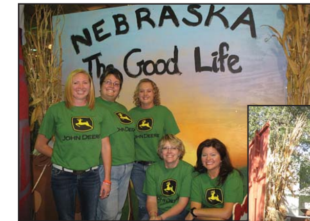
Hand painted 6 foot x 8 foot mural of a sunset