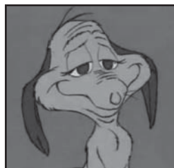
Max, the dog from "The Grinch Who Stole Christmas"