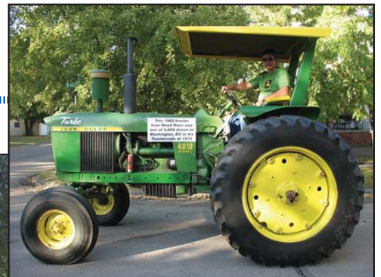
A 1962 John Deere tractor led the float