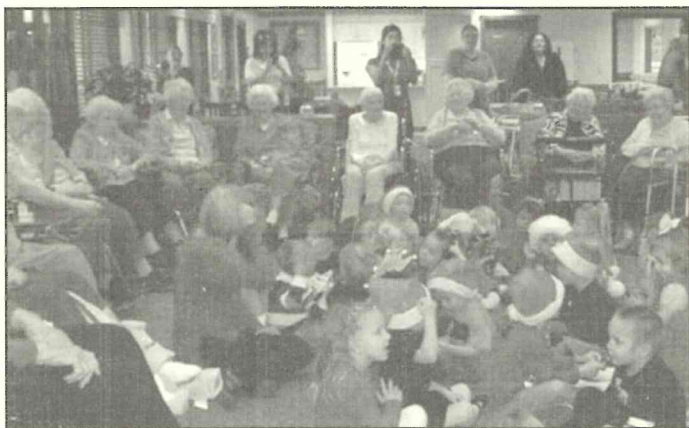
Residents and pre-schoolers had a great day.