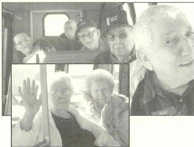
On January 10, 2012, residents enjoyed a Bus Ride to go and check out the new John Deere 2012 Combine.