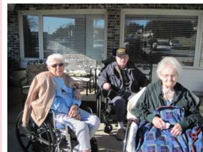
Enjoying the nice January weather...